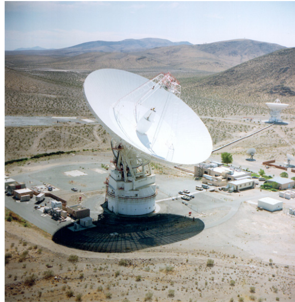
Figure 1. Deep Space Network facility

Schedules are currently manually generated a year into the future with allocations to the minute. These are currently generated a week at a time and average 370 tracks (allocation of an antenna to a mission over a time period) per week. These tracks are typically 1 to 8 hours long and must be allocated in a viewperiod (i.e. a time period when the spacecraft is visible to the antenna). There are around 1650 of these viewperiods defined per week. The DSN's goal is extend the schedule out to ten years where they are currently just predicting and adjusting resource loading based on coarse requirements. The near-term schedule (within 8 weeks) additionally considers the allocation of service-specific equipment, personnel controlling the antennas, and some additional geometric constraints on pointing the antenna. In this paper we describe how we are working with missions to employ scheduling algorithms to generate and repair mid-range (8